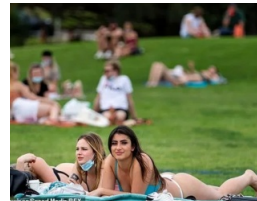
Melbourne Insanity: Mom Arrested At Beach For Traveling 'Outside Radius'