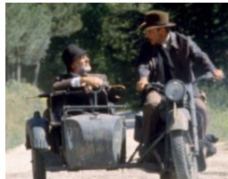
Harrison Ford Remembers Teasing 'Indiana Jones' Dad Sean Connery