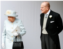
Book: Queen Elizabeth Got Violent With Prince Philip